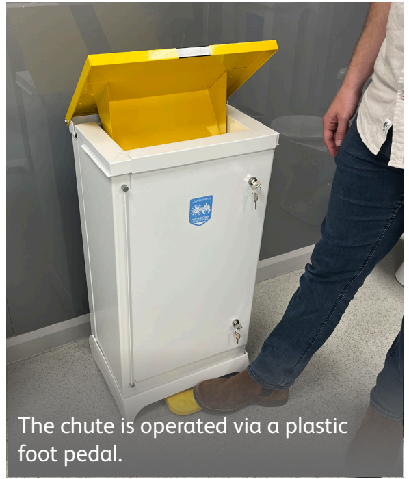
The chute is operated via a plastic foot pedal.