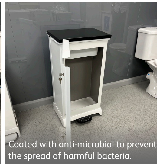
Coated with anti-microbial to prevent the spread of harmful bacteria.