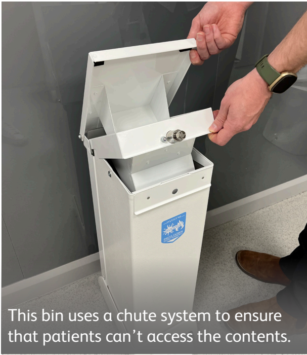
This bin uses a chute system to ensure that patients can't access the contents.