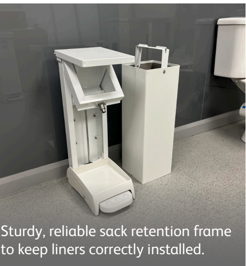
Sturdy, reliable sack retention frame to keep liners correctly installed.